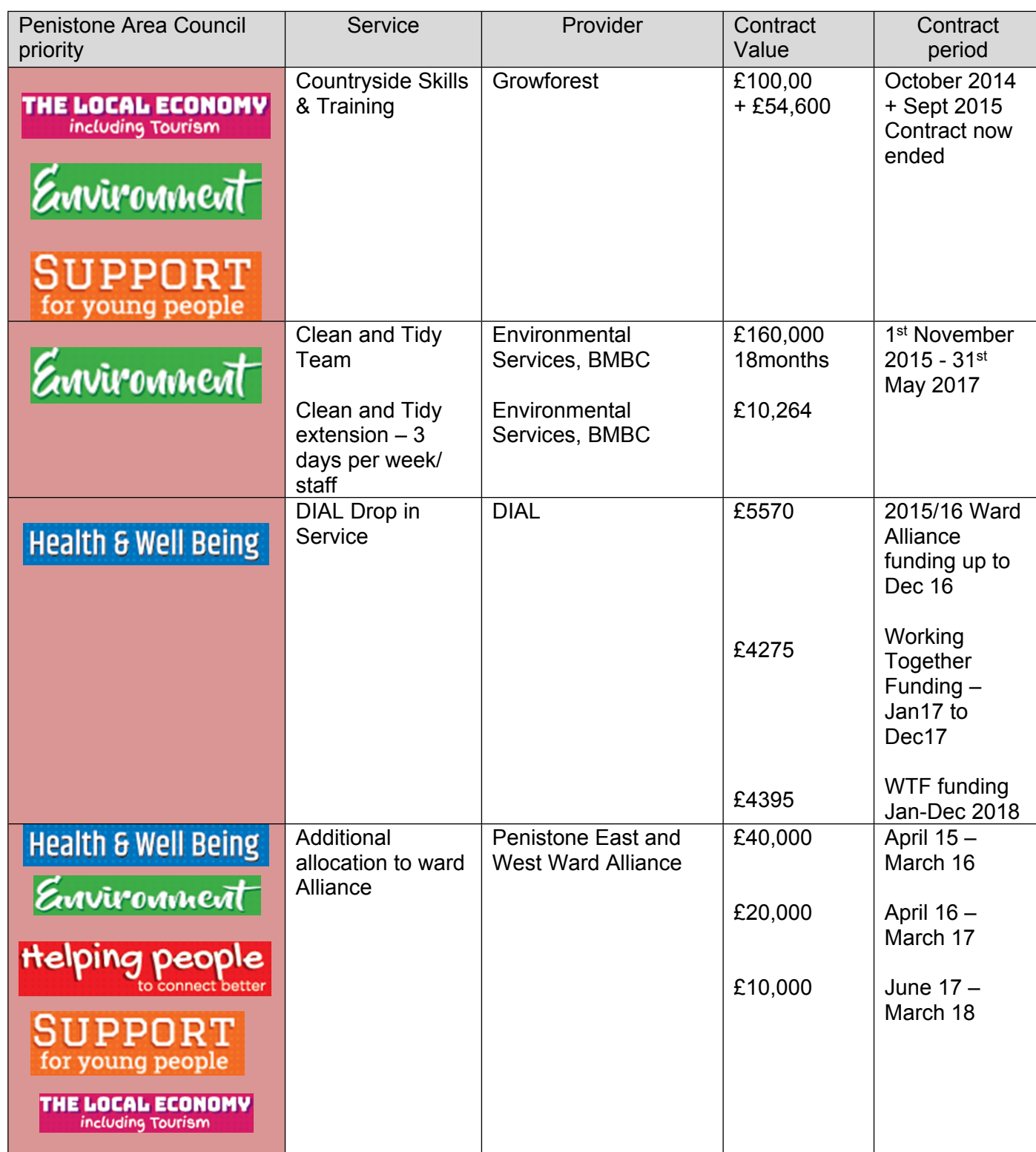
Table 1 below shows the providers that have been appointed to deliver services that address the priorities and deliver the outcomes and social value objectives for the Penistone Area Council.